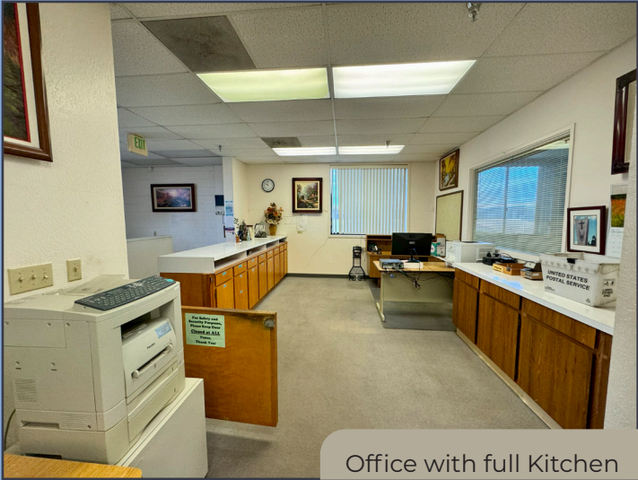
Office with full Kitchen