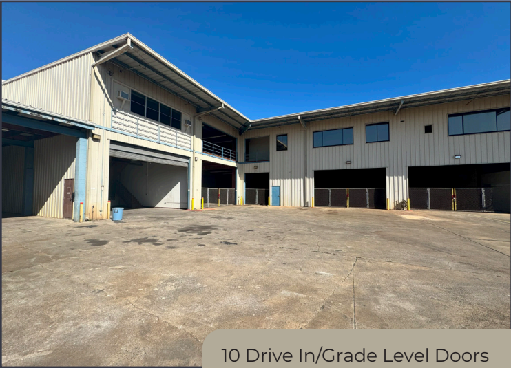
10 Drive In/Grade Level Doors