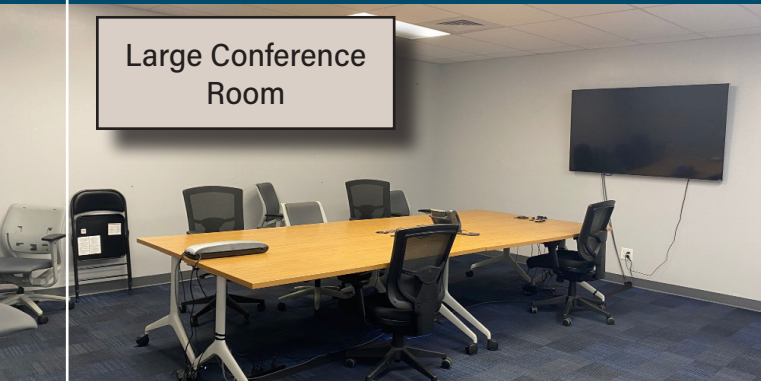
Large Conference Room