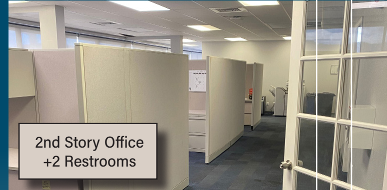
2nd Story Office +2 Restrooms